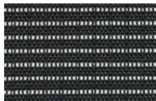
NK00 - Mod. H10

Supporting mesh | Résille de soutien | Malla reforzada